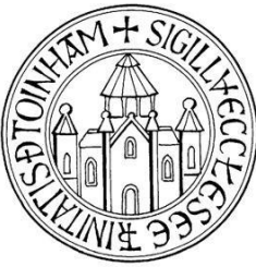
Parish of Christchurch