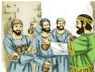
The Parable of the Talents